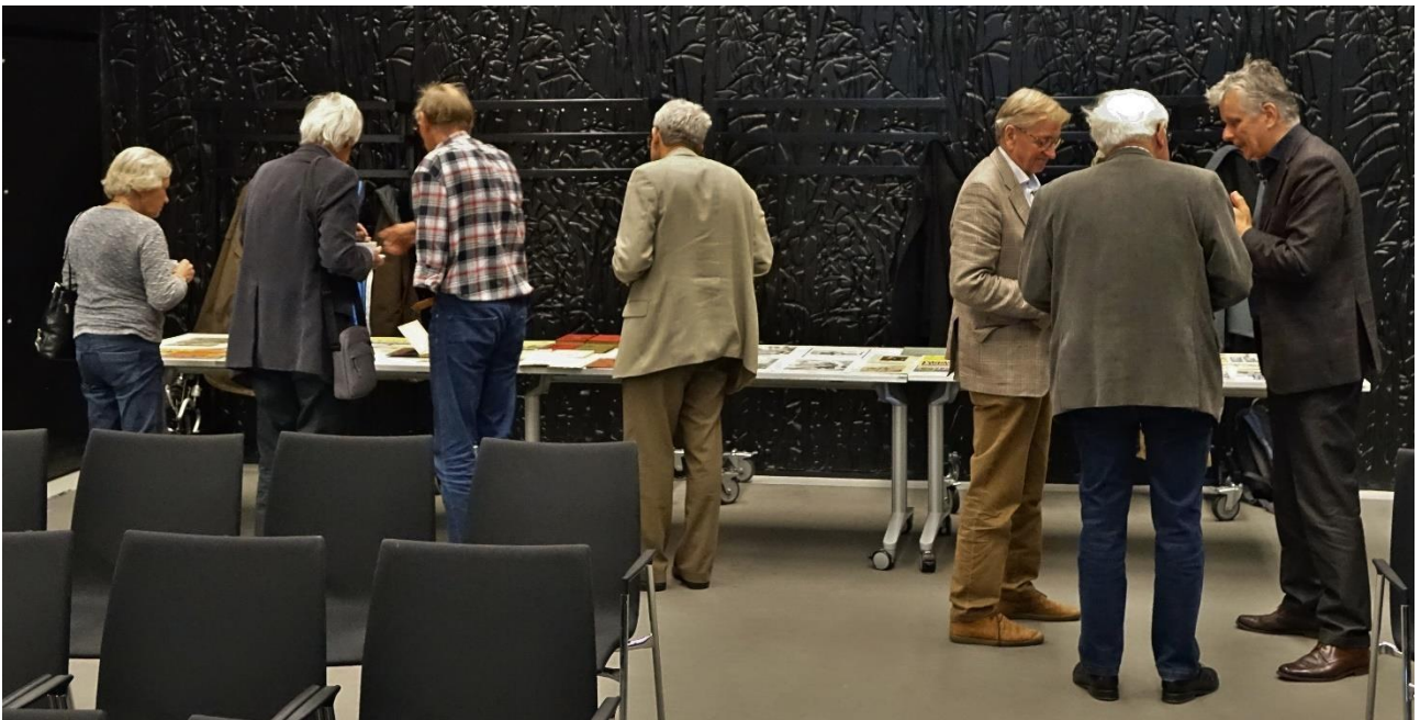
Participants listening to the lectures in the Booth Hall of the Utrecht University Library, looking at the exhibition and discussing with each other