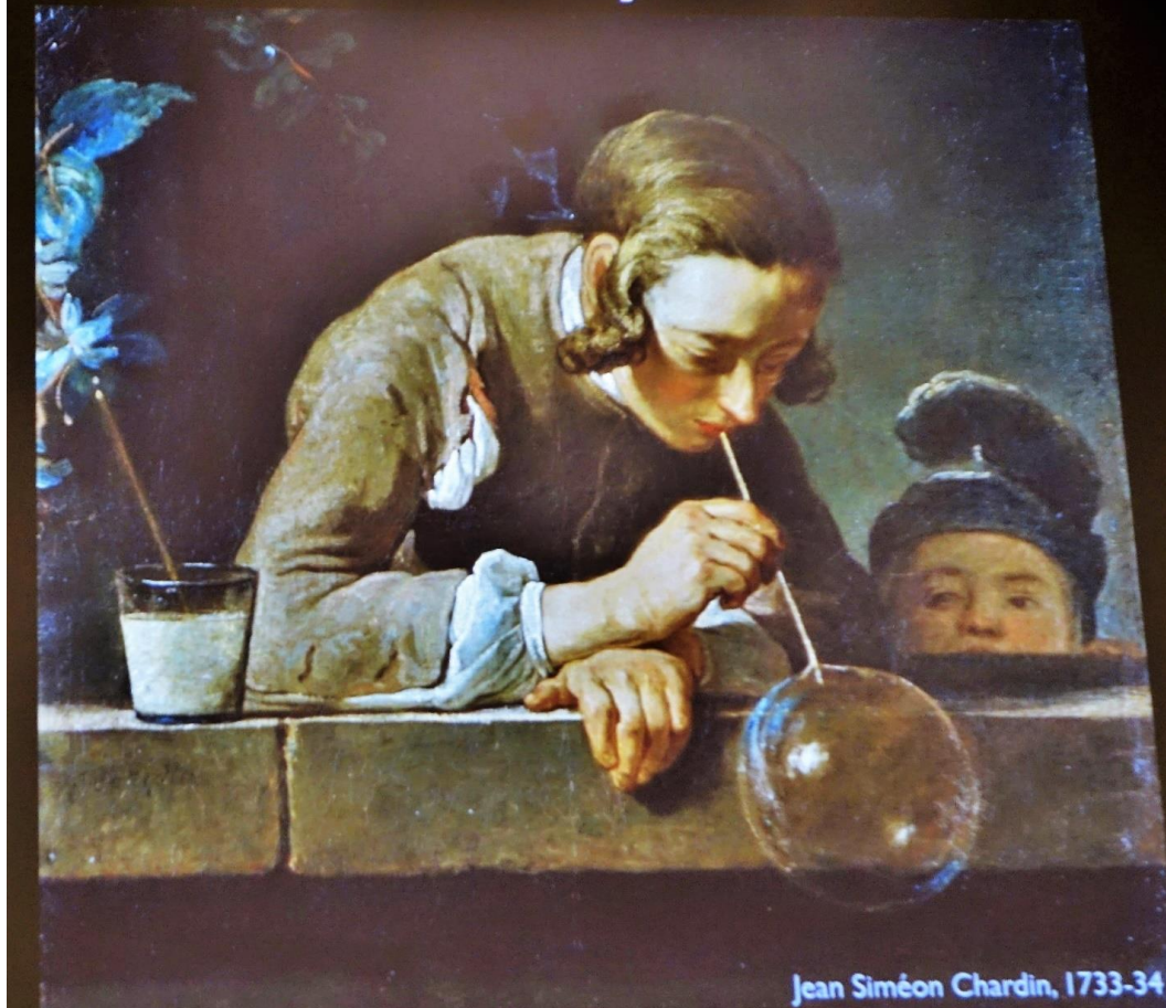
Last sheet of the symposium with a picture of the painting Soap Bubbles by Chardin (National Gallery of Art in Washington, DC)